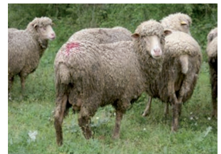
Figure 1. Sopravissana sheep breed.

ARQ was the predominant allele, followed by the ARR, AHQ and VRQ alleles at lower frequencies (Figure 2). The frequencies of the